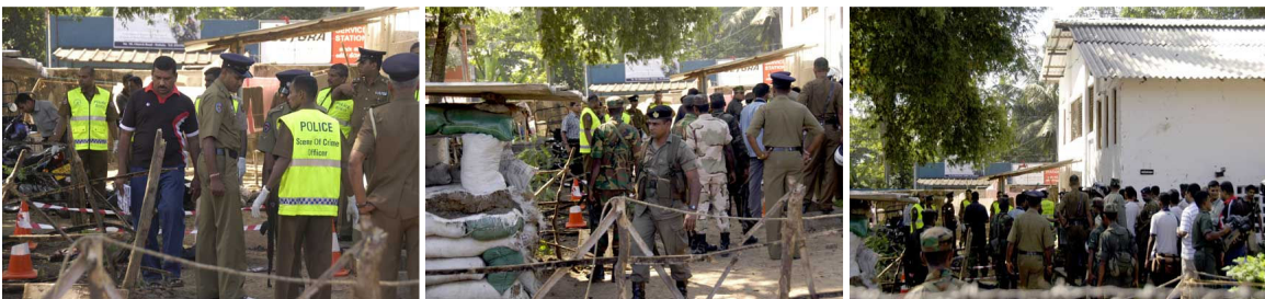
LTTE terrorists carried out the suicide bomb attack near the St. Anne's Church, at Hekitta, Wattala.