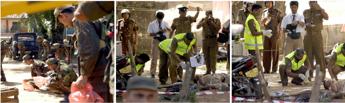
8 people were killed and 17 injured in the suicide bomb blast on Sunday(Dec 28).

According to eyewitnesses, the suicide bomber had exploded himself when he was stopped by the security personnel on guard from entering the CDF office.