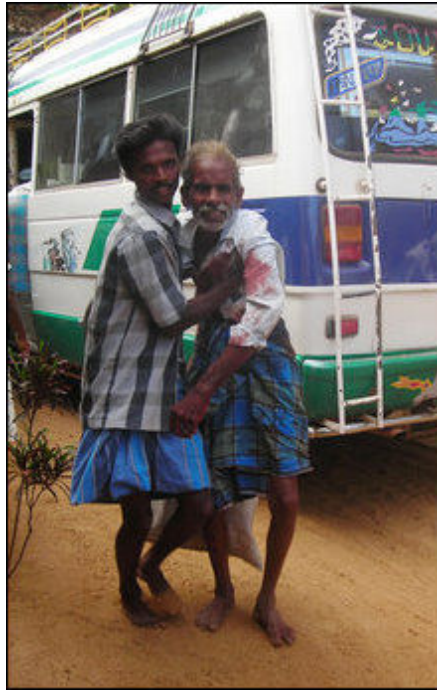
An elderly civilian wounded in SLAF bombardment