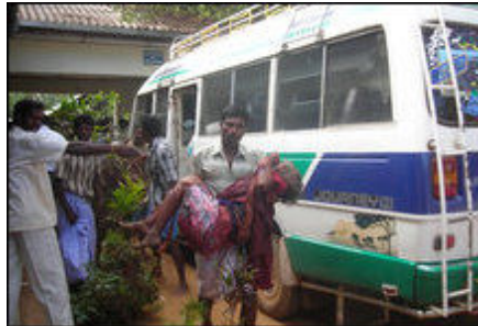
A civilian volunteer bringing a seriously wounded mother

Sri Lanka Air Force (SLAF) bombers attacked a civilian settlement near Murugananda school in Murasumoaddai on Paranthan - Mullaitheevu Road killing two females of a family and a male on the spot. Another man, who was seriously wounded, succumbed to his injuries at the hospital. 16 civilians, including a couple, were wounded. The attack has targeted three civilian settlements in Murasumoaddai Wednesday around 8:00 a.m. The indiscriminate bombardment on fleeing civilians, Internally Displaced Person's huts, close to the ICRC Karaichchi branch office, a school, temple and agricultural lands aims at instilling fear at the minds of the civilians in Vanni, observers said.